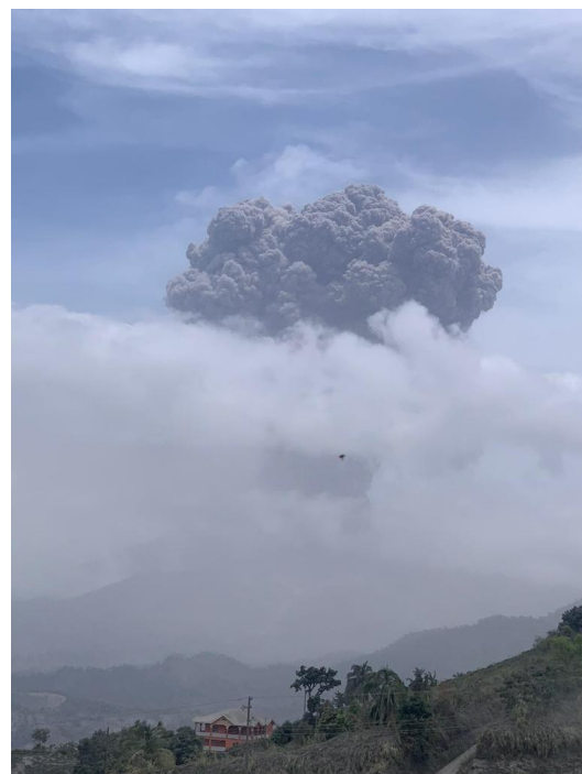
Explosive eruption at 11:32 AM 14/4/21.

Evacuation Orders have been issued. Access to the volcano is strictly prohibited.