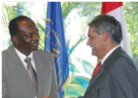
The Minister was particularly interested in the subject of State policies.

underscored the importance of the Forum for Leaders in Agriculture in promoting ties among the various stakeholders of rural life in the Americas.