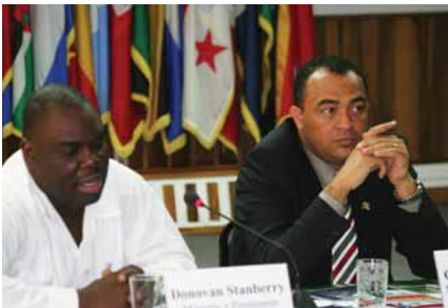
This visit served as the first step on the road to Jamaica 2009.

The research that the Minister requested of IICA will determine the true contribution of the expanded agricultural sector to the gross domestic product of Jamaica. Since 2002, the Institute has been doing this type of assessment based on a pioneering approach and using a methodology for identifying the forward and backward linkages of agriculture.