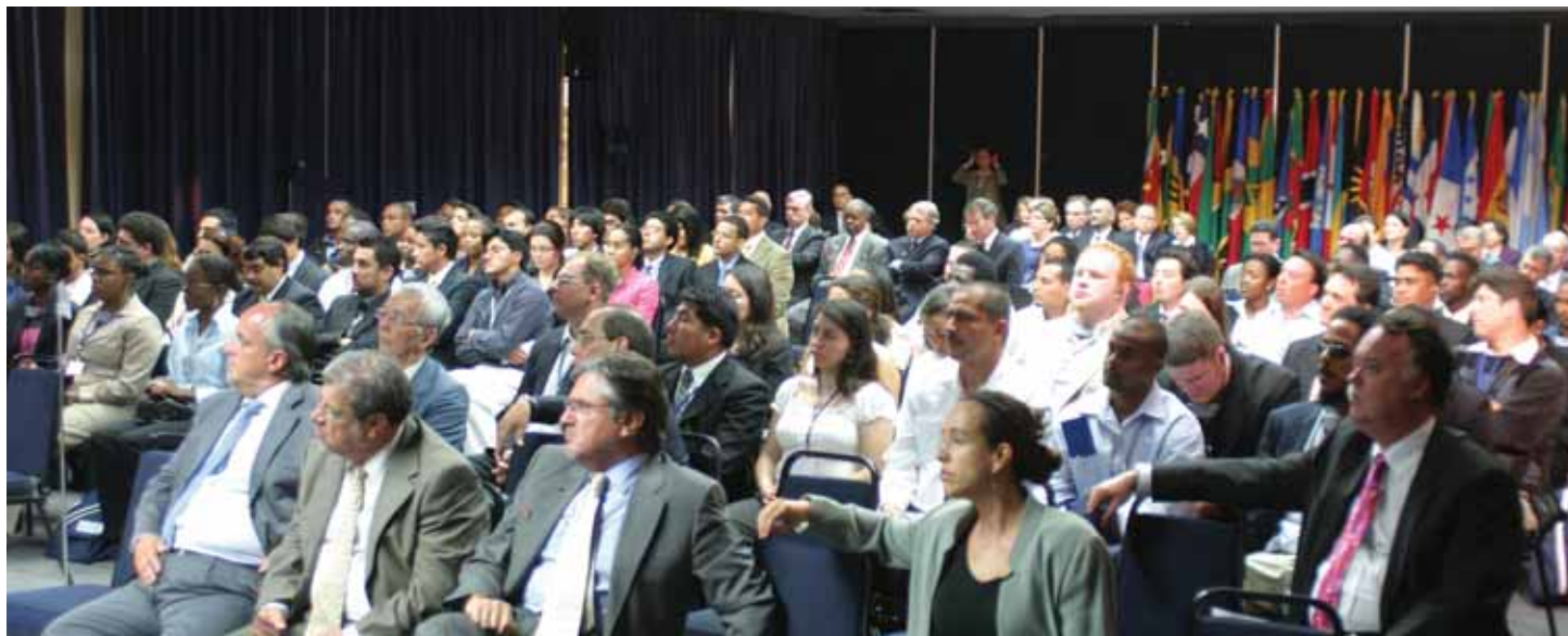
The inauguration of the Center was attended by officials from the agricultural sector in the Americas, the diplomatic corps accredited in Costa Rica, young leaders and staff members of IICA.