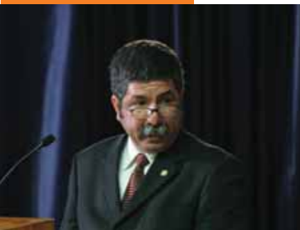
Deputy Minister of Agriculture, Livestock and Food of Guatemala, Mario Aldana

Taken from the speech by the Deputy Minister of Foreign Affairs of Costa Rica, Edgar Ugalde Alvarez, during the inauguration of the Center for Leadership in Agriculture.