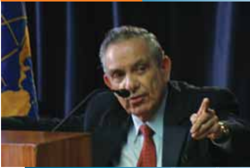
Deputy Minister of Foreign Affairs of Costa Rica, Edgar Ugalde Alvarez