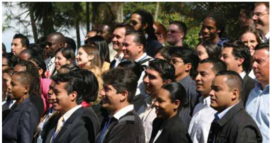
"You are the future of agriculture in the Americas", the Director General of IICA told them.