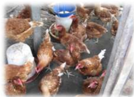
Kayapaati Chicken Coop Project