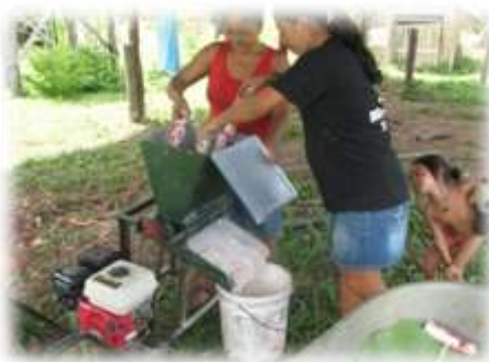
Kwamalasemutu, Food Security Project