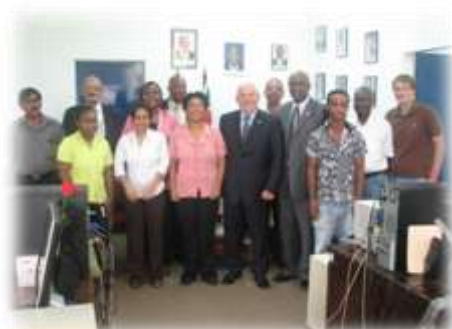
Director General visits Suriname