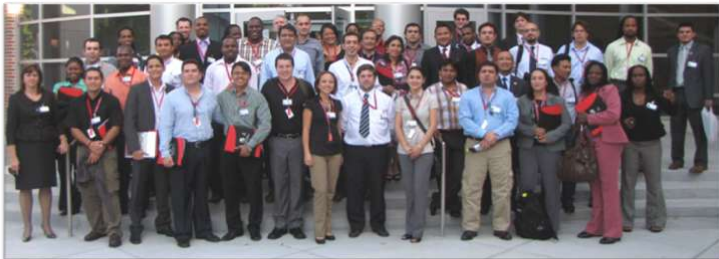
Participants at the forum for youth