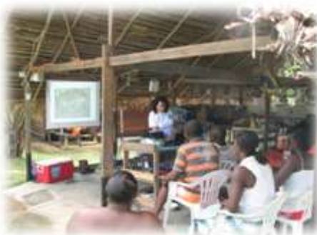
Kninipaati, Food Security Project