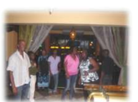
Socializing with IICA Guyana Staff