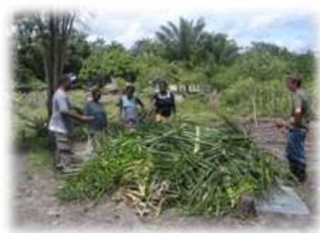
Godolo, Food Security Project