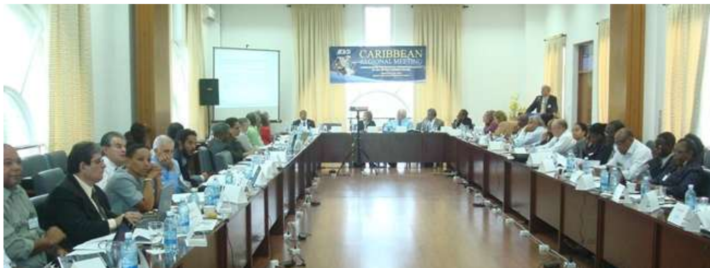
Participants at the Annual Caribbean Regional Meeting