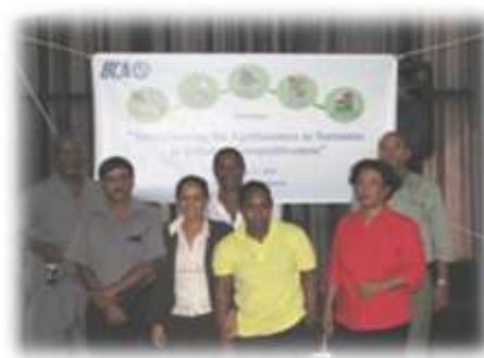
Value Chain Approach Workshop