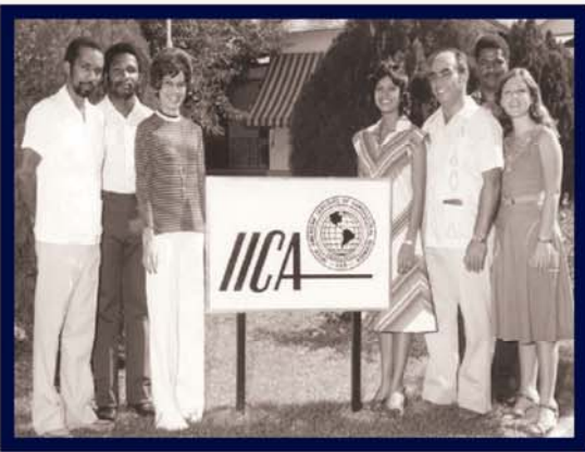
IICA Plants its Roots in Jamaica