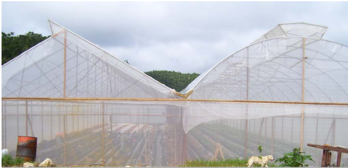
Two Types of Low Cost Greenhouse

Greenhouse production was introduced to Jamaica on a wide-scale in 2005. A few farmers planted lettuce, tomatoes and experimented with other crops before. As a form of Protective Agriculture it has shown great promise here.