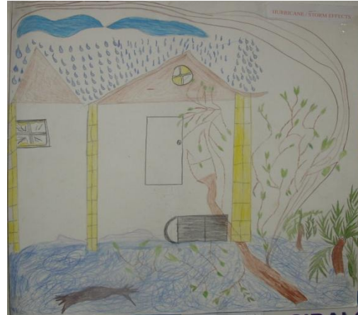
Poster 3 - Game Atilus

L. W. Young Junior High School – Grade 8