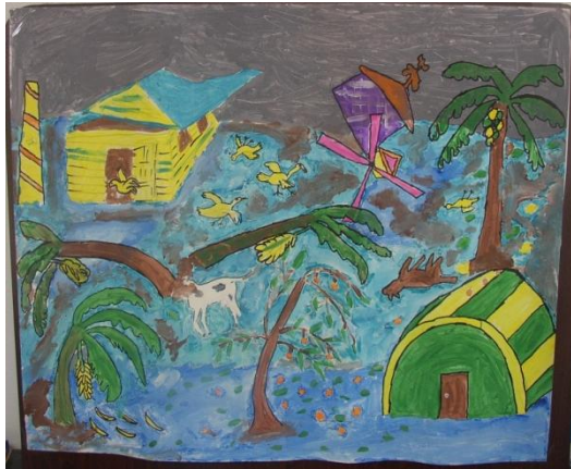
Poster 6 - Clementia Ellis

“Agriculture in Action around the Islands in the Bahamas”