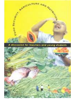
“Food Security, Agriculture and Nutrition: a discussion for teachers and young students” is the name of the brochure.

The project, which is jointly funded by IICA and the Caribbean Agricultural Research and Development Institute (CARDI), aims to raise the profile of domestic agriculture; educate and inform on food security and good nutrition, in an effort to better inform the public of Trinidad and Tobago and stimulate action towards changed buying habits and eating choices, while supporting domestic agriculture.