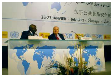
The Director General of the Food and Agriculture Organization (FAO) of the United Nations, Jacques Diouf, and the Minister of Foreign Affairs and Cooperation of Spain, Miguel Angel Moratinos, participated in the meeting.

Participated in world meeting to reduce poverty and hunger worldwide.